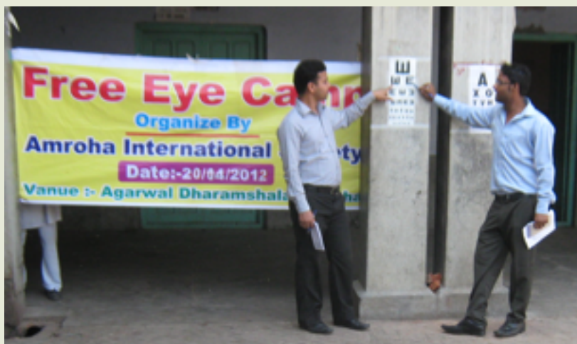
AIS Cataract Camp on 20 April 2012

See more photos of the two eye camps on page 3.